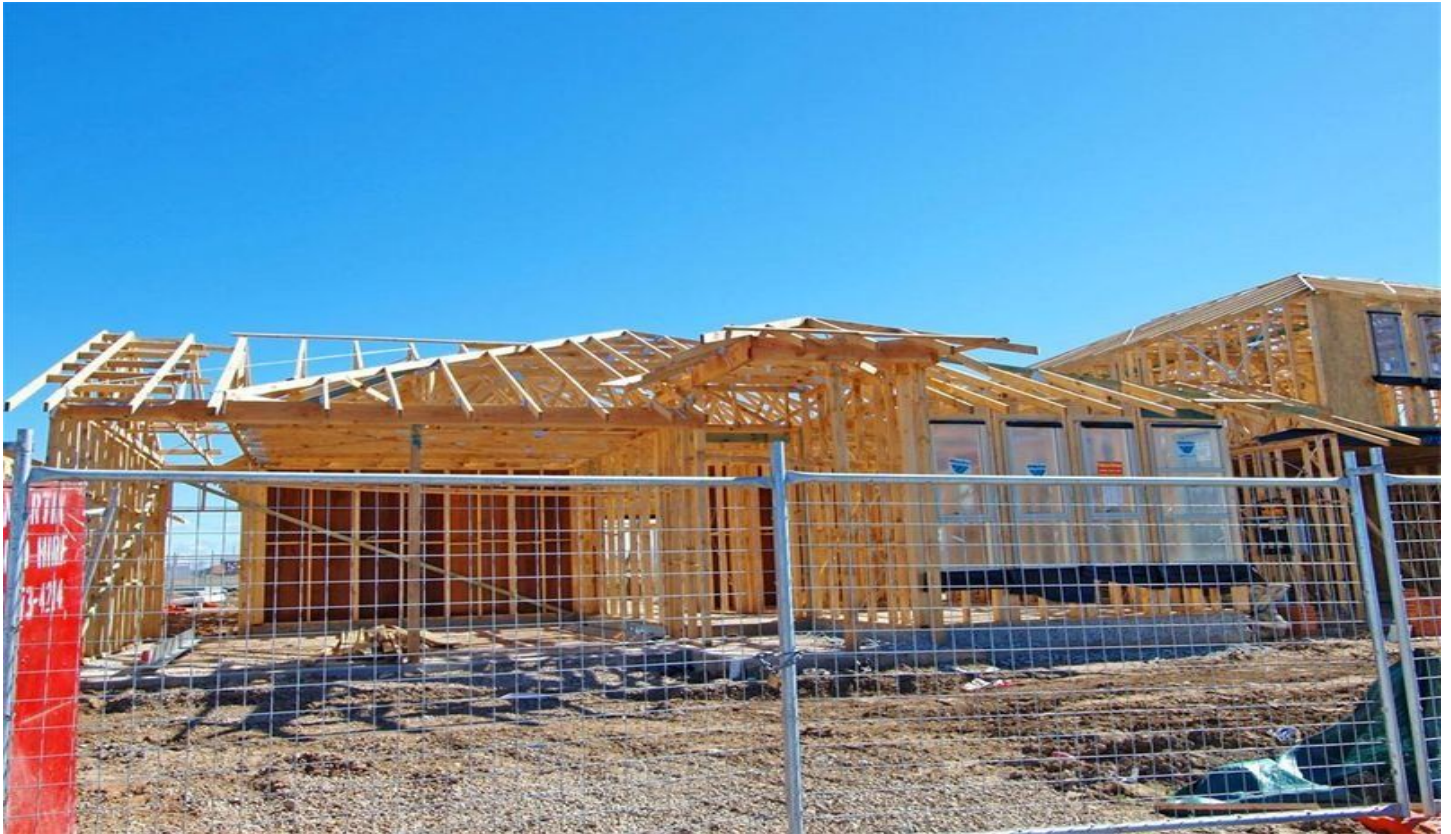
LOT 2 CICADA STREET THE PONDS